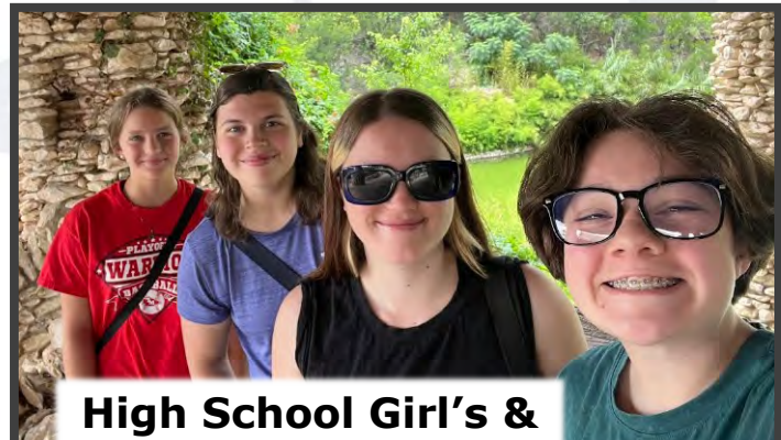
High School Girl's & Guy's Trips