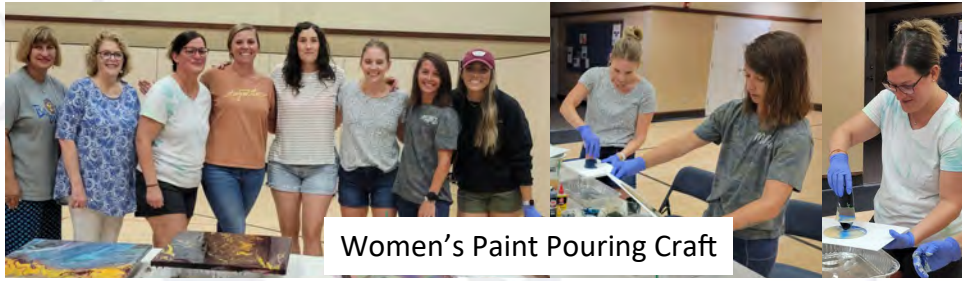
Women's Paint Pouring Craft