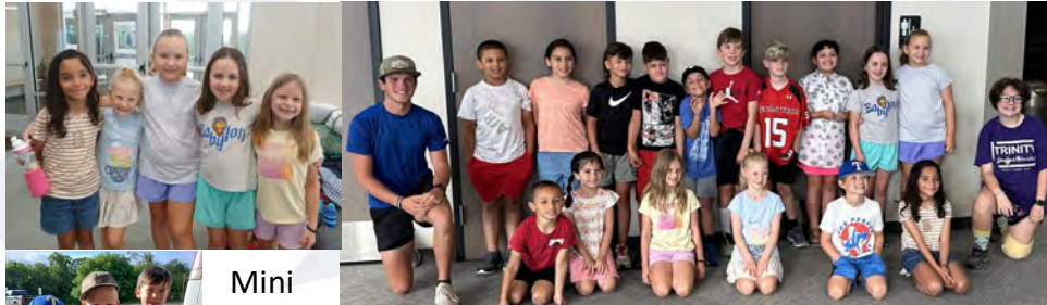
Mini Kid's Camp