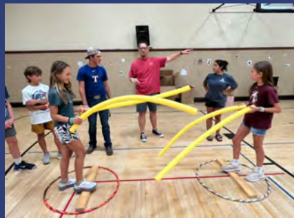
Middle School Theme Night