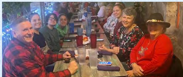
Christmas on the River Walk!