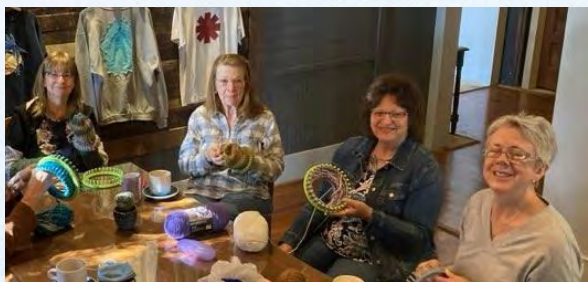
Trinity "Hatters" hard at work!