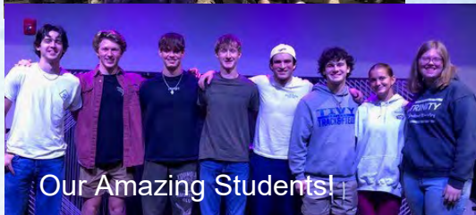
Our Amazing Students!