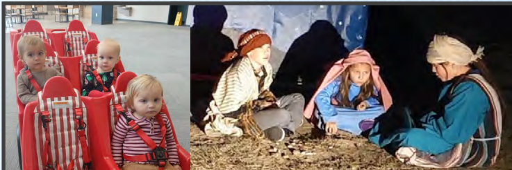
CDO "littles" enjoying a stroll and Night in Bethlehem